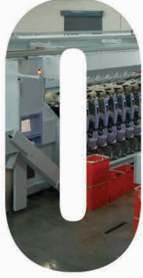
ENRICHING LIVES SINCE 1935