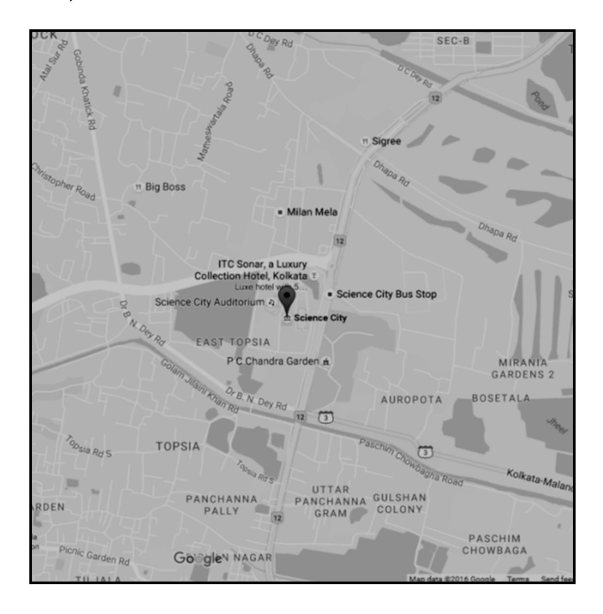
Route Map of the Venue of the 85th Annual General Meeting-Seminar Hall, S-18 (A & B) of the Science City, J.B.S. Haldane Avenue, Kolkata – 700046